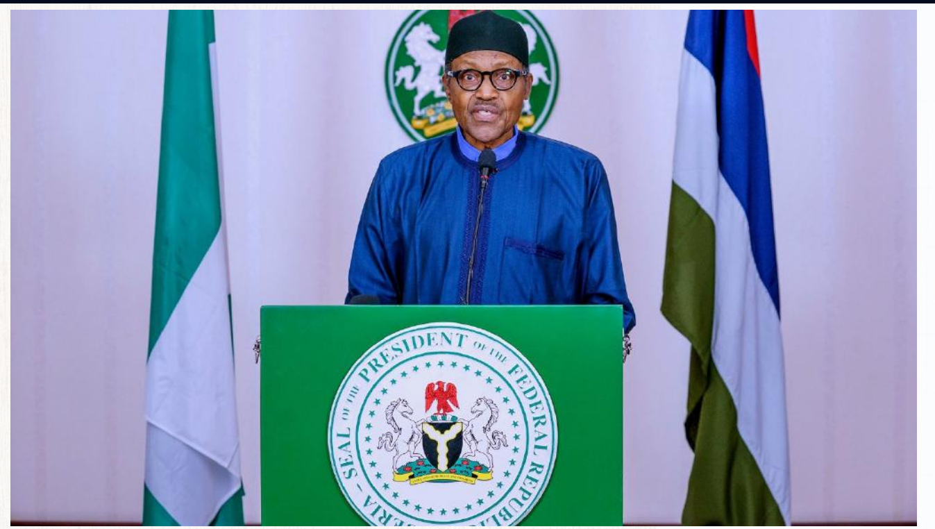
Muhammadu Buhari, President, Federal Republic of Nigeria

In a nationwide broadcast to celebrate Democracy Day, President Muhammadu Buhari said youths will be engaged in special public works program aimed at cushioning the effects of the economic downturn. Each of the 774 local government areas in the country will be allotted 1,000 slots and a total of 774,000 jobs will be created.