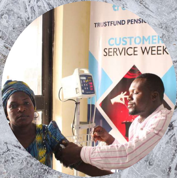
Customer receiving medical check up.