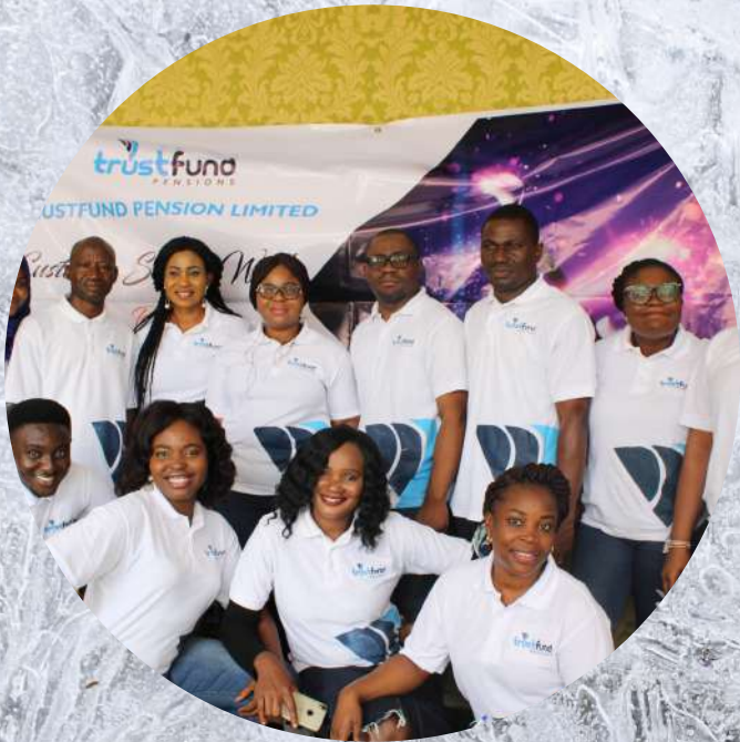
CUSTOMER RELATIONSHIP MANAGEMENT TEAM